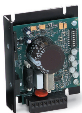
Chassis Controls WPM Model 0783 (90V and 130VDC)

Bodine DC speed controls are designed to deliver optimal performance from our 12, 24, 90, or 130 Volt PMDC motors and gearmotors. Stock controls are available with either filtered or unfiltered DC output. Current limit, torque limit, maximum/minimum speed, and acceleration/deceleration time can all be adjusted to fit your application. Chassis models feature either ¼ inch quick connect tabs or terminal block connections. Enclosed models meet NEMA-1 or NEMA-4 standards for environmental protection. For more information, visit www.bodine-electric.com .