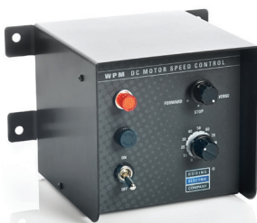
Enclosed Speed Controls WPM Model 0790, 0794 UPM Model 0867 (115 VAC input)